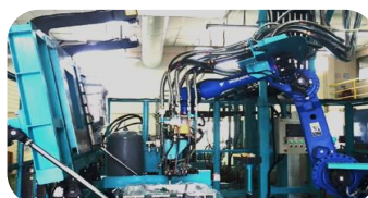
Robotic Foaming Machine