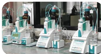
Automatic Potentiometric titration