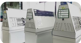
QUV Weathering Tester