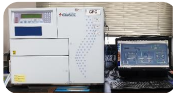
Gel Permeation Chromatography (GPC)